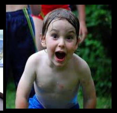
We can say it in different ways! Same thing yet mean something very different.