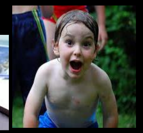
We can say it in different ways! Same thing yet mean something very different.