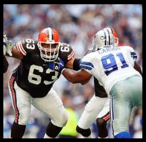
Why do they put the really big guys up front?