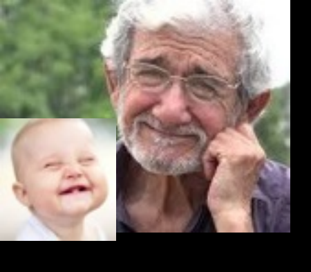
Joy <u>No</u> One <u>Can</u> Take <u>Away</u>