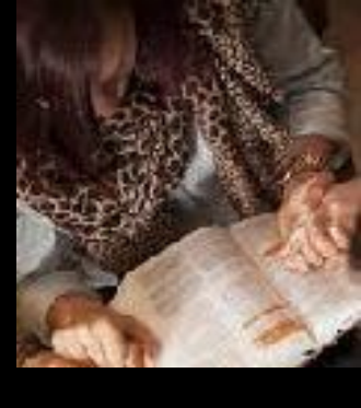
The most popular & frequent spiritual activity is

But your iniquities have separated you from your God; and your sins have hidden His face from you, so that He will not hear.