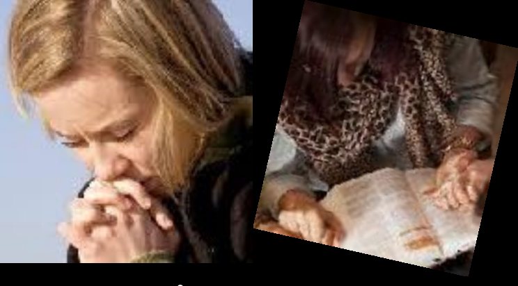
The most popular & frequent spiritual activity is If I regard iniquity in my heart, the Lord will not hear. - Psalm 66:18