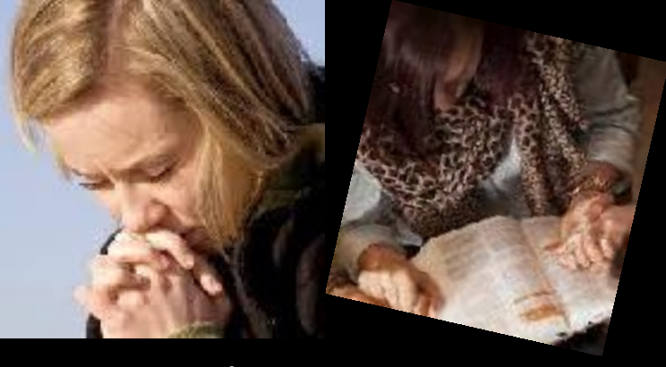
The most popular & frequent spiritual activity is Husbands ... that your prayers