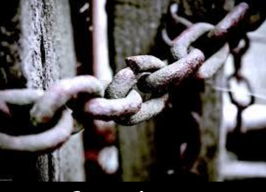
If you find out ... one is weak in faith?