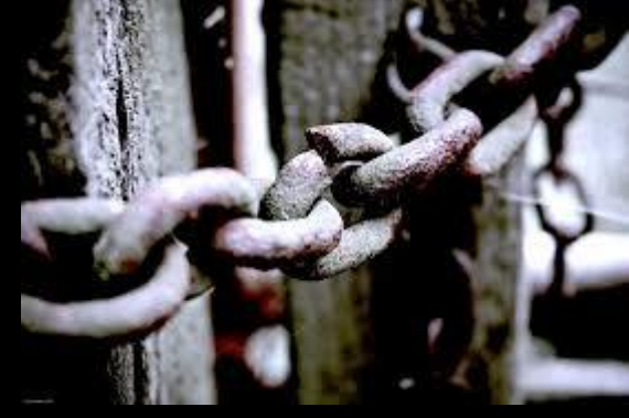
If you find out ... there is a weak link?